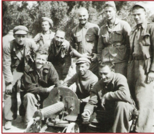
Abraham Lincoln Brigade from the United States fighting in Spanish Civil War, 1937, Aragón

Maria , 18 (lyric soprano) Traumatized first by witnessing her parents being executed, then gang-raped by the Fascists, she was saved by the guerrillas led by Pablo, when they blew up the train taking her south to a prison camp. Not part of the guerrilla band herself, she has found a place among them preparing food under Pilar's