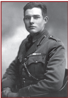
Ernest Hemingway Milan, 1918

H emingway was a larger-than-life personality. In his popular novel, For Whom the Bell Tolls , we can see some of the author in the character of Robert Jordan, an idealistic young American in 1930's Spain, who accepts a doomed mission to blow up a bridge.